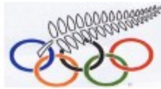
The New Zealand Olympic Committee